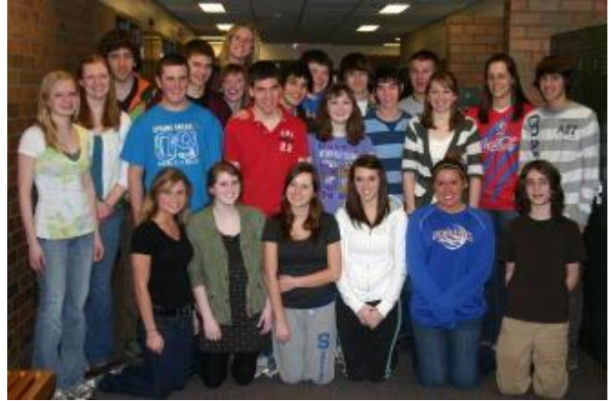
Saugatuck High School Advanced Placement Language and Composition students