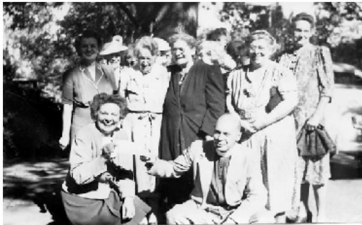
From the Guild: $500.00

During the period from 1944-1945 a number of other additions to the furnishing of the church was made: new hymnals for choir and congregation were purchased; glass flower vases were purchased; the set of green Eucharistic vestments was given by the Guild; a lavabo bowl, six office lights, a Baptismal shell, a ciborium for the chapel, an alms receiving basin were given by individuals as indicated in the appendix.