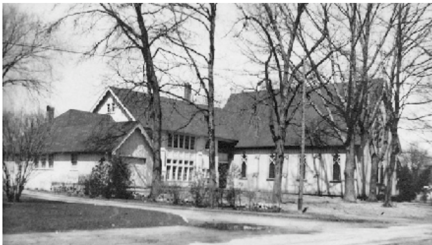
"A thing of beauty is a joy forever."