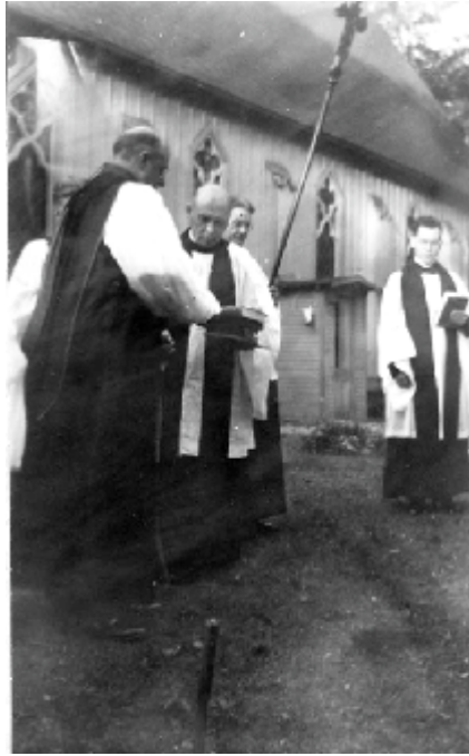
The Ground Breaking