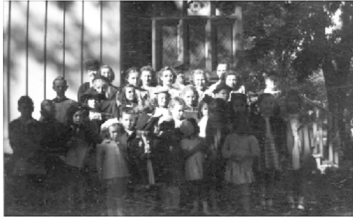
Church School in 1946

One could never overestimate the value of this assistance, both in dollars and leadership. Yet the great need was to strengthen the position of the Church within the community to the point where local support and leadership would be sufficient for the ordinary needs. There would always be opportunities for the interested summer friends to render significant assistance. This shift in emphasis from the summer phase to the year-round phase was, the Rector felt, a "must".