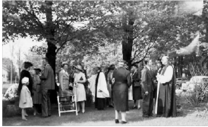
Group at Dedication of the Garden