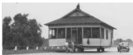
On the way to a new home