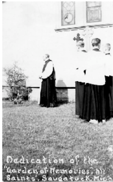
The Bishop and Acolytes