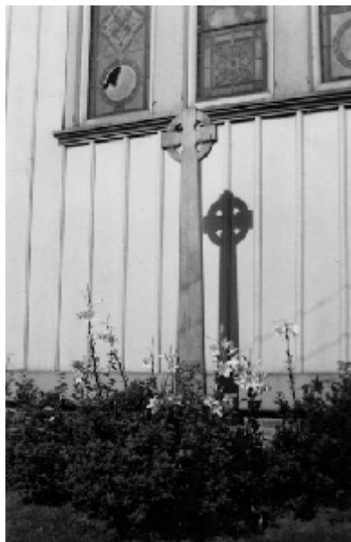
The Cross and Madonna Lilies