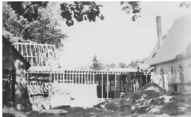
Construction, June 1946