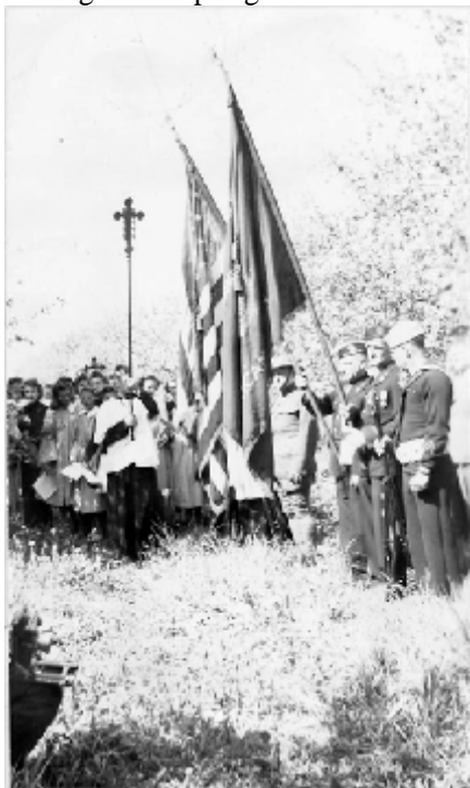
Blessing of the Blossoms

In 1940 the Vicar interested a number of people in and around Fennville in the idea of a "Blessing of the Blossoms" service in one of the orchards. The local acolytes assisted on this and subsequent occasions, the last one being in the spring of 1947.