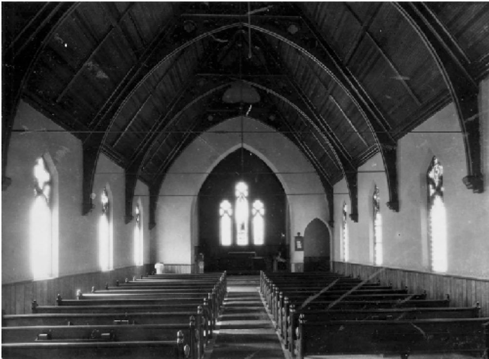
The interior at an early date.