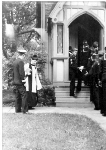
Sea Scouts at Church