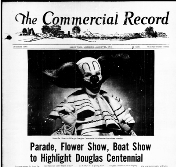
"Bozo the Clown will begin Douglas Centennial festivities Monday" - Aug 13, 1970

We expect the remaining CRs through 1977 to