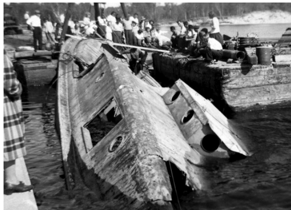
Gotham sunk